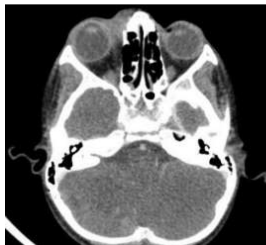
Fig. 7: Contrast enhanced CT in axial plane showing right-sided superficial orbital lymphovenous malformation