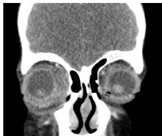
Fig. 6: Contrast enhanced CT in coronal plane showing right-sided superficial orbital lymphovenous malformation