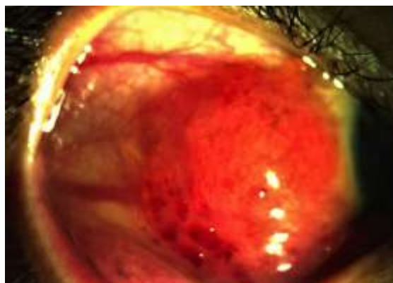
Fig. 3: Temporal extent of the reddish vascular bulbar conjunctival mass in the right eye.