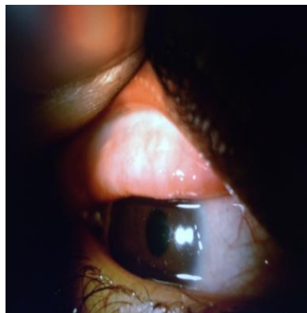
Fig. 3: Palpebral form