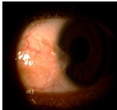
Fig. 1: Pre-operative

In Group B (n=48), commercially available wet amniotic membrane was used as Graft. After proper preparation of scleral bared area, freshly prepared fibrin glue was used to oppose the graft with the sclera bed stiches were not used in either of group. After completion of surgery pad and bandage was applied for 24 hours. Post-operatively antibiotic-steroid eye drops was prescribed for 14 day. Caboxymethylcellulose for 15 day oral analgesic SOS patients were followed as per scheduled. The observations thus made were discussed with current available literature and then conclusions were drawn from present study.