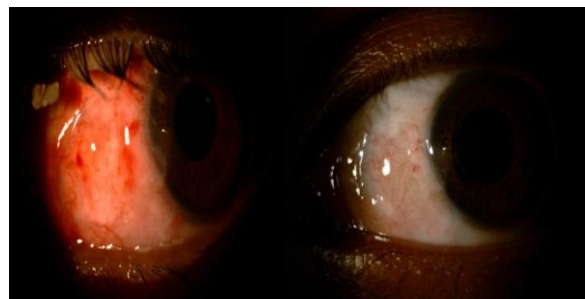
Fig. 2: Post-operative (Group A)