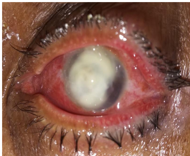
Fig. 2: Case 2: Patient with chronic dacryocystitis and nasolacrimal duct obstruction, male, 65 years old, left eye congestion and throbbing pain following injury with vegetative matter. Matting of eyelashes, sticky discharge with corneal ulcer.