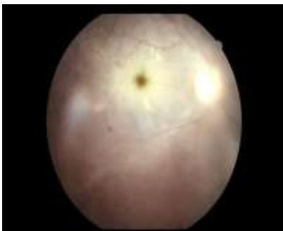
Fig. 4: Central Retinal artery occlusion