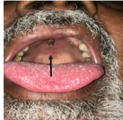
Fig. 5: Hard palate lesion