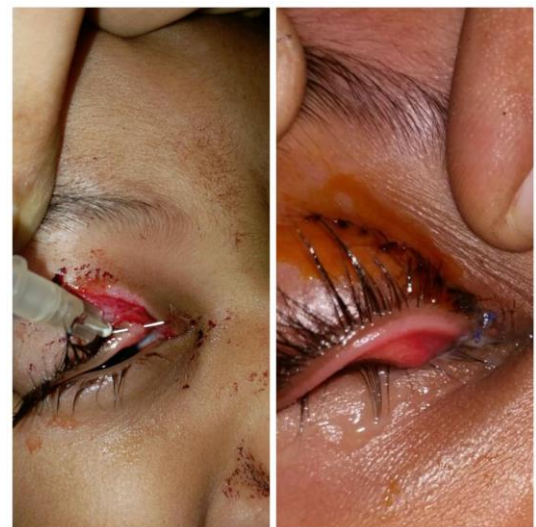
Fig. 2: A shows upper canalicular laceration by knife, Fig. 2 B shows upper canaliculus repair with Mini Monoka stent insertion