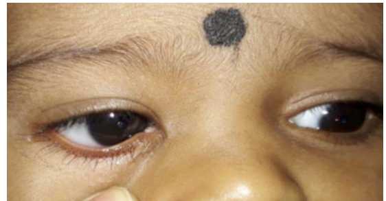
Fig. 2: Shows 2yr old child who came with feeding associated canalicular trauma due to blouse hook injury underwent a canalicular repair with a Mini Monoka silicone stent. The stent is seen in situ in lower punctum

projectile associated injury with stone & knife 5 patients (25%) Metal rod and dog bites: 1 (5%) each. All cases were operated within 24 hours of injury. Subconjunctival haemorrhage was the most common associated ocular co-morbidity, and was seen in 7/20 (35%) of the cases. Orbital fracture was the second most frequent ocular co-morbidity and fracture Orbital floor was noted in 2/20 (10%). All stents were removed at six weeks. One patient returned at 3 weeks with a prolapsed stent – irrigation suggested a canalicular obstruction – he denied any intervention. Irrigation was performed in 16/16 adults and fluorescein dye disappearance test was performed in the four children. The lacrimal system showed no obstruction in 19/20 (95%) cases with 1 case presenting with tube extrusion (5%) being the sole failure. No punctal granuloma, slit-like punctum or complications were seen in the entire cohort.