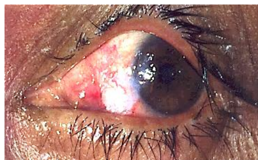
Fig. 2: Post-operative