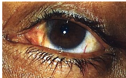
Fig. 1: Pre-operative

The study population comprised of 38 patients (40 eyes). All the 40 pterygia were primary cases. They were subjected to two methods of management and followed up for a duration of six months.