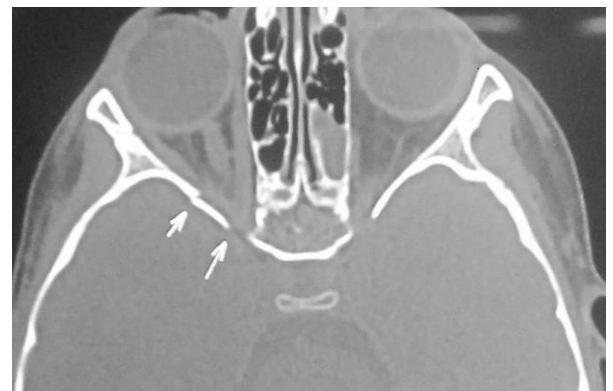
Fig. 1: CT Orbit and Brain without contrast showing fracture Greater and Lesser wing of Sphenoid bone

suggestive of post traumatic optic neuropathy. Visual evoked potential (VEP) showed delayed amplitude and prolonged latency in right eye. Neurosurgeon opinion was sought. Patient was continued on Topical antibiotic drops, oral steroids and was explained regarding the visual prognosis of RE. At 1 month follow up the patient was reviewed, examination revealed persistent total afferent pupillary defect, temporal disc pallor on fundus examination and regained extra-ocular movements on RE. Patient's parents were counseled regarding the poor visual prognosis and advised to take proper care of the LE.