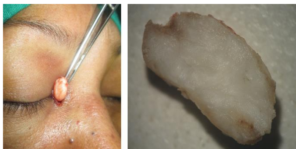
Fig. 1: Showing gross per-operative appearance and cut section of the tumour