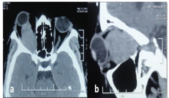
Fig. 2: Axial (Fig. 2a) and sagittal (Fig. 2b) CT scans showing well defined isodense mass in the intraconal space of the right orbit