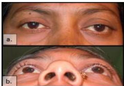
Fig. 1a, b: Left sided mild proptosis

A 52 year old lady presented with left sided loss of vision and proptosis noticed since 6 months. On examination her right eye vision was 20/20 and anterior and posterior segment was normal. The left eye had no perception of light, and fundus examination revealed optic atrophy. She had 2 mm of proptosis and restricted ocular movements in all gazes (Fig. 1). There was no lagophthalmos and corneal sensations were preserved.