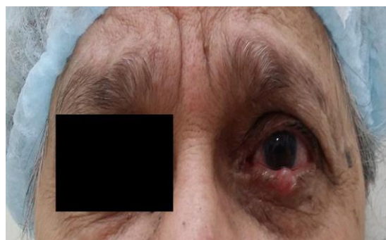
Fig. 1: Nodular swelling present in the margin of the lower lid measuring about 5 mm in diameter. The surface is smooth and there is loss of eyelashes

spread clinically. There was no palpable regional lymphadenopathy. With a clinical suspicion of a lid malignancy she underwent wide excision of the lesion followed by lid reconstruction. The specimen was sent for histopathological analysis.