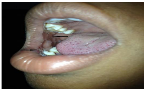
Fig 2: The black arrow lines show the bite marks where the patient had chewed her buccal mucosa to induce bleeding

Finally, when she was asked to open her mouth, her buccal mucosa on the right side showed signs of injury. There were bite marks and bleeding points in the inner side. When the child was confronted with the findings she declined of doing it deliberately. But on further asking and explaining it to her how much of emotional trauma it caused to her family, she finally admitted of biting off her mucosa, taking out the blood with her fingers, and dabbing it on her cheeks when no one was watching. She admitted of doing such to gain attention towards herself.