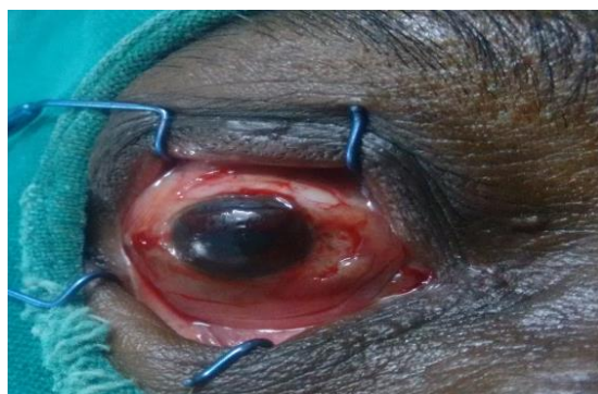
Fig. 2: Intraoperative