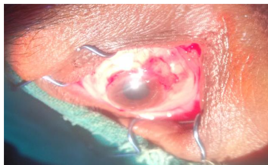
Fig. 3: Post op. after grafting