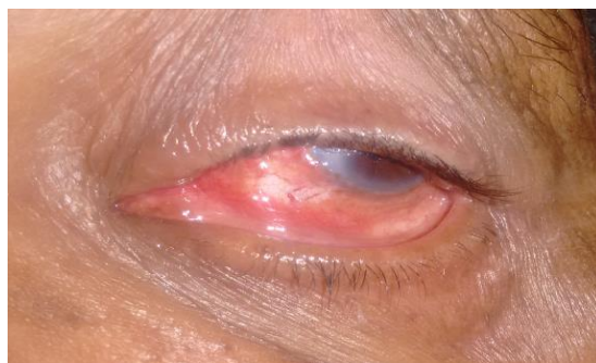
Fig. 4: Graft retraction day 1