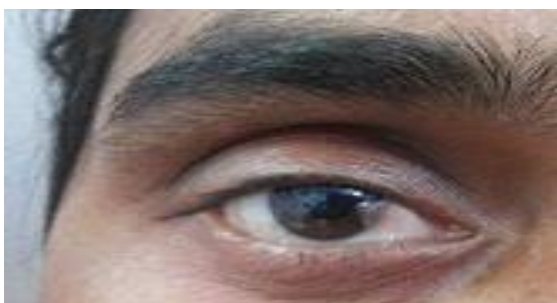
Fig. 1: Primary pterygium