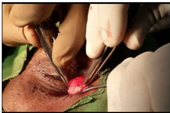
Fig. 2: Gauge pellets used intraoperative period to soak blood