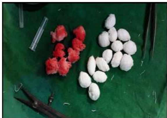
Fig. 3: Blood soaked guage pellets