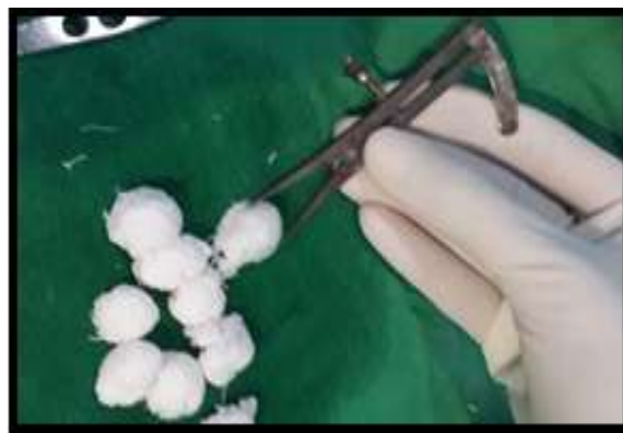
Fig. 1: Standardization of gauge pellets

Patients with contraindications for dacryocystorhinostomy underwent dacryocystectomy. All the patients were operated under local anaesthesia with 2% lignocaine with adrenaline and 0.5% bupivacaine infiltrated at the sac area. The patients who underwent dacryocystorhinostomy were given nasal pack just prior to the operating procedure. The nasal packs were removed 24 hours after operation. The operating time was calculated by using watch from skin incision to skin closure. The intraoperative bleeding was calculated by the numbers of gauge pellets soaked (size of each pellet was standardized 2×2 cm) with blood postoperatively. The pellets were prepared after soaking the gauge in normal saline and squeezing.