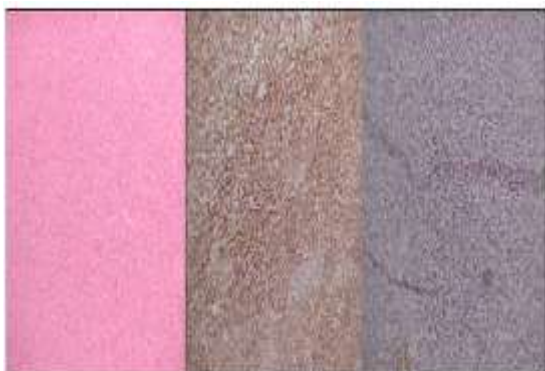
Fig. 5: Photomicrograph of Histopathology & Immunohistochemistry of Synovial Sarcoma