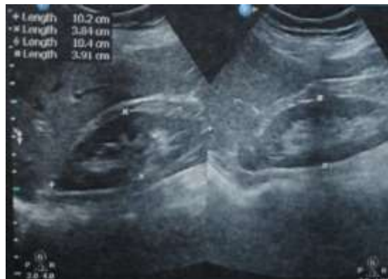
Fig. 6: Normal study of USG of the Abdomen