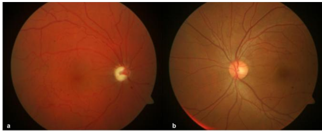
Figure 2: Colour fundus photo (Carl Zeiss, Germany); a: RE shows advanced glaucomatous cupping, vessel tortuosity and diffuse red 'tomato-ketchup' appearance; b: LE shows normal fundus