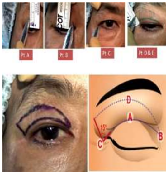
Fig. 1: Authors technique of eyelid markings for UEB

In same sitting, the ROOF is repositioned back for restoring the eyebrow volume along with its internal fixation at desired position i.e. 2-3 mm above the supraorbital rim, with two non-absorbable sutures. The orbicularis muscle is closed with interrupted 6-0 absorbable sutures. A trademark suture 'K-suture' (5-7, interrupted, horizontal mattress) is applied taking the pretarsal skin, orbicularis oculi muscle, LPS fibres and skin, to create a prominent and desired eyelid crease(Fig. 3h). The skin is then approximated with continuous or interrupted, preferably non-absorbable sutures(8-0 prolene)(Fig. 3i). One may encounter 'dog ears' at the temporal ends and the Burow's triangle can be a good option for closing keeping the curve superiorly concave. The scar should not extend beyond the line joining lateral canthus and temporal end of eyebrow to avoid its visibility in primary gaze. Antibiotic ointment is applied with sterile dressing. The authors strongly recommend the use of small ice packs (preferably sterile) over the dressing to reduce the edema, enhance patient comfort and providing tamponade. The head end of the patient is raised and bilateral eye patching is recommended for 4-6 hours followed by patients' choice for its removal.