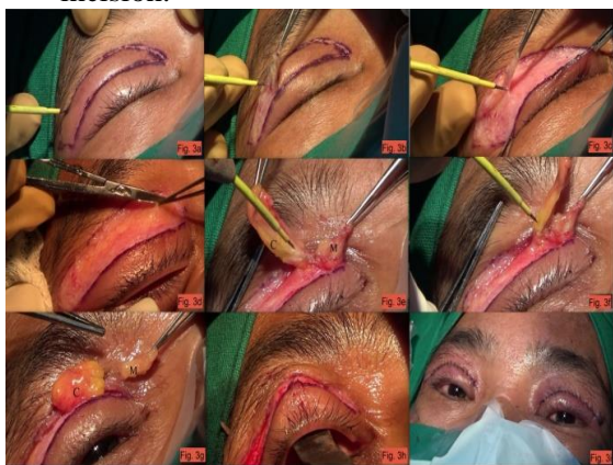
Fig. 3: Surgical Steps