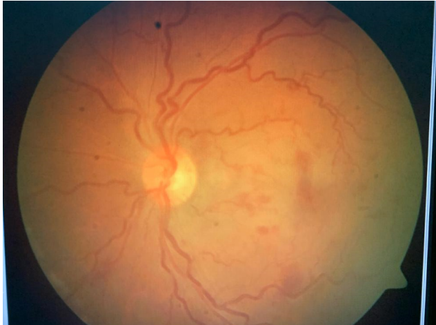
Fig. 2: CRVO in a case of orino-orbital mucormycosis (2)