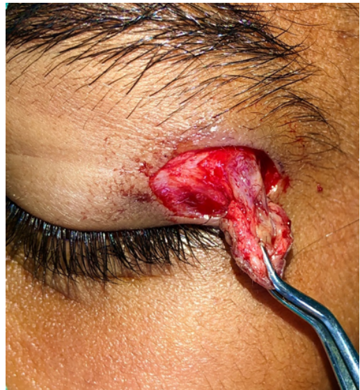
Fig. 3: A horizontal superficial incision given and the orbicularis oculi muscle being dissected.