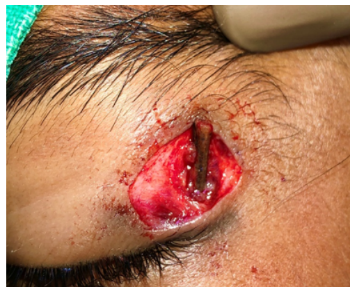
Fig. 4: After removal of necrotic tissue a retained preseptal wooden foreign was identified and then removed.