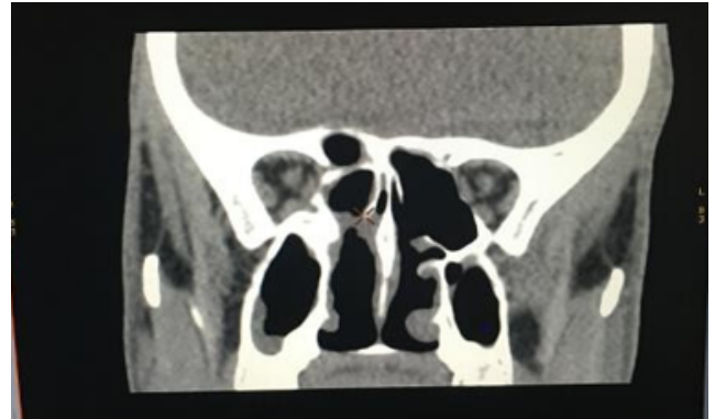
Fig. 5: Post Op CT scan showing enlarged empty PNS