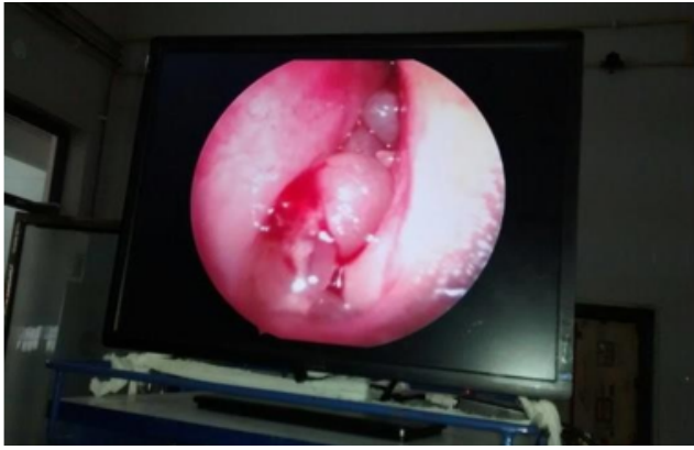
Fig. 1: Endoscopic picture showing polyposis in nasal cavity