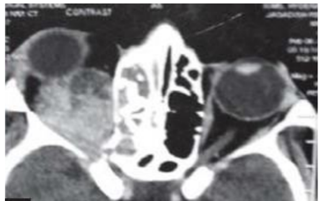
Fig. 6: Involvement of the anterior and posterior ethmoid sinuses and an orbital extension