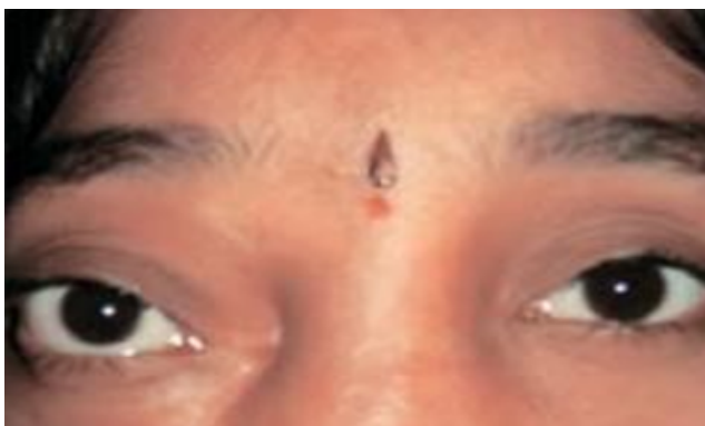
Fig. 4: Eccentric Proptosis secondary to AFPS