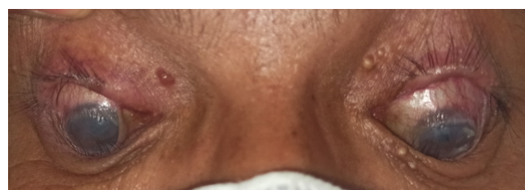
Fig. 2: Conjunctival xerosis and Symblepheron due to cicatrization and Corneal xerosis and keratinization of both eyes seen in a case of SJS