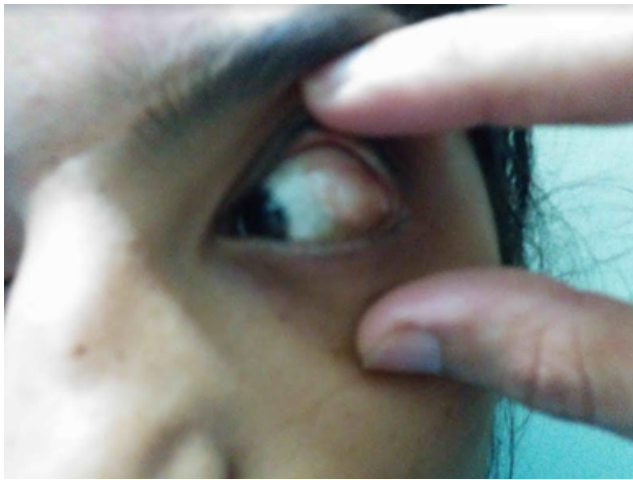
Fig. 1: Atpresentation