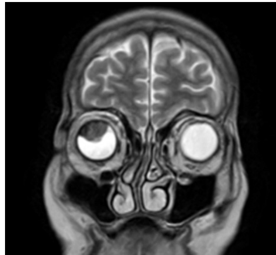
Fig. 3: MRI axial view of skull showing well-defined lobulated altered signal intensity intraocular lesion measuring 1.5x1.7x1.3cm, which is predominantly hyperintense on T1 and mixed signal intensity on T2, and showing post contrast heterogeneous enhancement, noted in the superotemporal side of the right eye, limited to the posterior chamber, associated with exudative retinal detachment, hemorrhagic subretinal fluid and vitreous hemorrhage, all features suggestive of choroidal melanoma.

commonly found in Caucasian females in the age group of 50-60 years. In contrast, our patient was a 71 year old Indian lady. 5 Secondary elevation of intraocular pressure (IOP) occurs in 5% of intra ocular tumors and in 2% of choroidal melanomas. 6 Tumors of the posterior segment are more likely to cause glaucoma. 3,6 The secondary glaucoma has been reported to be due to various mechanisms like angle invasion of tumor cells, angle closure by mass effect on the iris, iris neovascularization, hyphema and supra choroidal hemorrhage. 3,7,8