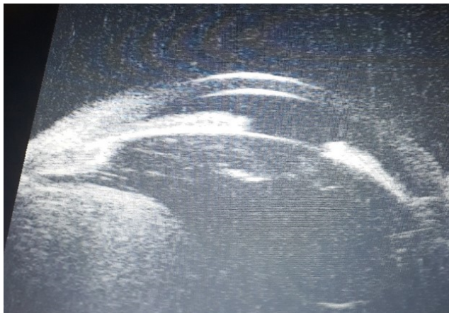
Fig. 1: Ultrasound biomicroscopy (UBM) showing a dome-shaped retro-lenticular mass with anterior displacement of the lens and angle closure.

She chose not to undergo any further treatment for the metastasis.