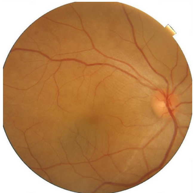
Fig. 2: VKH syndrome