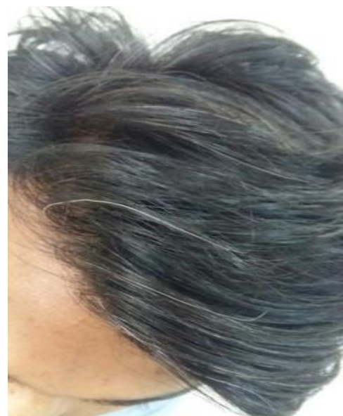
Fig. 1: Greying of hairs

headache. The vision loss started in left eye a day before right eye. There was no history of penetrating ocular trauma or surgery. He had greying of hairs on his head for last two years. (Fig. 1)