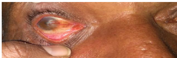
Fig. 5: Aggressive regrowth of pterygium tissue in patient operated with pterygium excision with AMG