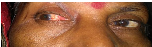
Fig. 3: Showing partial graft dehiscence of CAG in initial pre-operative day (day 3).

In 6 months of post-operative observation 2(3.23%) patients in CAG group and 6(9.68%) patients in AMG group had recurrence of pterygium or fibrovascular tissue at the site of previous pterygium excision, Fig. 4, 5. 1 patient with temporal pterygium had symblepharon in the intermediate period of observation in CAG group.