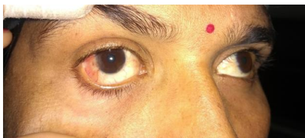
Fig. 4: Recurrence of temporal pterygium with symblepharon near lateral canthus in right eye following 15 days of pterygium excision with autologous blood clot conjunctival autografting