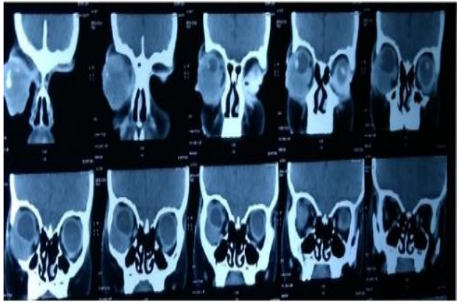
Fig. 3: CT scan coronal section showing globe distorsion with involvement of inferior rectus and inferior oblique muscle.