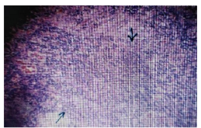
Fig. 6: histopathology slide showing features suggestive of IMT fibrous stroma infiltrated by plasma cells and lymphocytes.