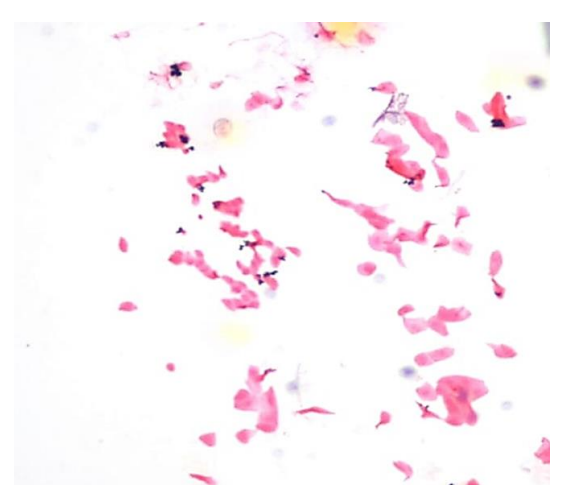
Fig. 1: Shows squamous cells with goblet cells indicating Nelson grade \boldsymbol{0}

controls. Mean TBUT in computer users was 11.06 \pm 2.42 and in controls it was 14.86 \pm 3.62 seconds. 53% of computer users had grade 0, 1 on CIC; 41% had grade 2 and 6% grade 3. On the contrary, 92.5% of the controls had grade 0, 1 on CIC. (Table 2) Computer users showed CIC results between grade 2 to 3.Whereas control group showed grade 0 and 1.