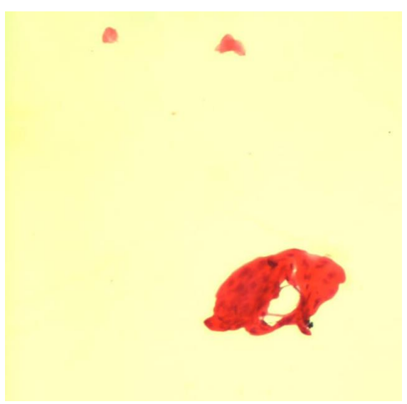
Fig. 4: Shows squamous cells with N:C of 1:4 indicating Nelson grade 2