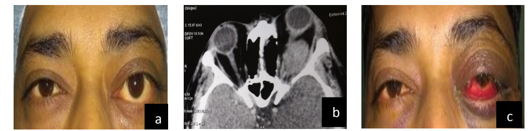
Fig. 1: a:Clinical photograph showing proptosis; b: CT scan, axial view showing an intraconal mass extending upto apex; c: Postoperative clinical photograph showing proptosis and ecchymosis

examination of the right eye was normal. Left eye showed an axial proptosis with increased resistance to retropulsion [Fig. 1a]. Pupillary reaction was brisk. Orbital rim was intact, extraocular movements were normal, no regional lymph nodes palpable. His color vision and full threshold visual fields were normal. CT scan suggested a large, well defined intraconal mass in the left orbit between the lateral rectus and the optic nerve extending from the mid orbit extending till the orbital apex [Fig. 1b]. A provisional diagnosis of cavernous hemangioma or schwannoma was made. Left lateral orbitotomy under guarded prognosis was planned after a detailed discussion of the possible complications with the patient.