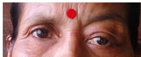
Fig. 1: Mass in the upper part of the left orbit

Transillumination was negative. There was proptosis of 28 mm noted in anterior-posterior direction in the left eye. (Figure 2) Extraocular movement was normal in all cardinal gazes. There was no lid lag and/or lid retraction. Bell's phenomenon was normal. Anterior and posterior segment of both eyes were normal.