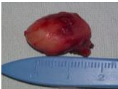
Fig. 4: Lacrimal gland tumour

The mass was removed in toto along with its pseudocapsule (Fig. 4). The frontal process of zygomatic bone was replaced back with good fixation without the use of any sutures or screws. There was no bony tissue