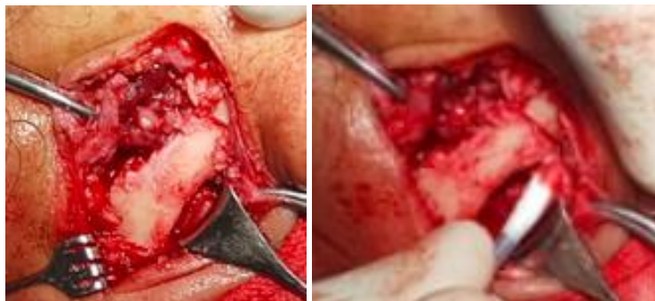
Fig. 3: Frontal process of zygomatic before & after

bone (Fig. 3). Then about 40mm segment of the frontal process of the zygomatic bone was removed using chisel and hammer to make horizontal cuts in the superior and inferior bony margins.