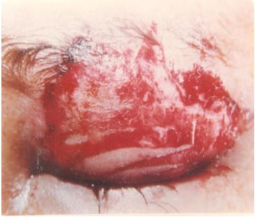
Fig. 3: Abrasions and lacerations LUL