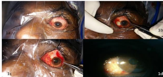
Fig. 1a: Nasal pterygium, b: bare scleral bed post ptergium excision, c: conjuctival graft placed over the scleral bed after rupturing a blood vessel after 10mts. D: graft well taken up over a scleral bed on 6<sup>th</sup> week, with healed corneal epithelium