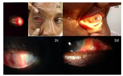
Fig. 2 a, c, d: Conjuctival graft recession on temporal, b: Graft recessed superiorly