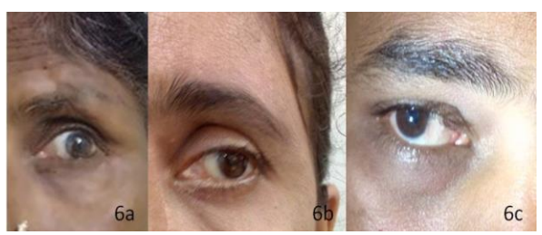
Fig. 6a: Long term follow up 1-18 month, b: 24 month, c: 36 month-post graft sutureless