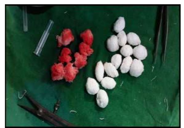
Fig. 3: Blood soaked guage pellets