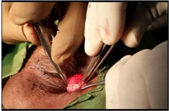
Fig. 2: Gauge pellets used intraoperative period to soak blood