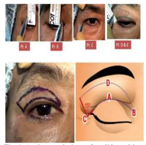
Fig. 1: Authors technique of eyelid markings for UEB

In same sitting, the ROOF is reposited back for restoring the eyebrow volume along with its internal fixation at desired position i.e. 2-3 mm above the supraorbital rim, with two nonabsorbable sutures. The orbicularis muscle is closed with interrupted 6-0 absorbable sutures. A trademark suture 'K-suture' (5-7, interrupted, horizontal mattress) is applied taking the pretarsal skin, orbicularis oculi muscle, LPS fibres and skin, to create a prominent and desired eyelid crease(Fig. 3h). The skin is then approximated with continuous interrupted, preferably non-absorbable sutures(8-0 prolene)(Fig. 3i). One may encounter 'dog ears' at the temporal ends and the Burow's triangle can be a good option for closing keeping the curve superiorly concave. The scar should not extend beyond the line joining lateral canthus and temporal end of eyebrow to avoid its visibility in primary gaze. Antibiotic ointment is applied with sterile dressing. The authors strongly recommend the use of small ice packs (preferably sterile) over the dressing to reduce the edema, enhance patient comfort and providing tamponade. The head end of the patient is raised and bilateral eye patching is recommended for 4-6 hours followed by patients' choice for its removal.