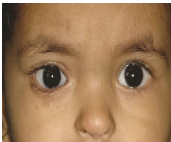
Fig. 1: A case of anterior (corneal) staphyloma of right eye