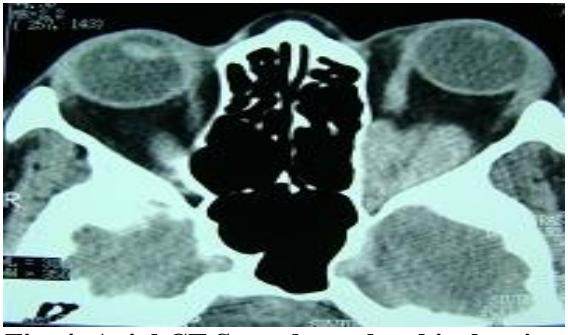
Fig. 4: Axial CT Scan through orbit showing orbital apex syndrome