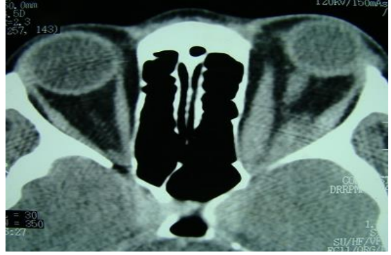
Fig. 3: Axial CT scan through mid-orbit showing left eye, thickening of the medial and lateral rectus muscles with tendon sparing. Asymmetrical changes

tomography (CT) (Fig. 3 & 4) or magnetic resonance imaging (MRI). Magnetic resonance imaging (MRI) can be used to differentiate radio graphically between active and inactive diseases. In TAO, the extra-ocular muscles are iso-intense to normal muscle on T1-weighted MRI and hyperintense on T2 depending on the degree of edema(Fig. 5a & b). The absence of edema may demonstrate a fibrotic phase. The correlation of water content (edema) and inflammatory activity can also be detected with MRI short-term inversion recovery (STIR) sequencing. Latest results on the predictive value of the signal intensity ratio (SIR) in MRI-TIRM suggest a correlation between SIR and the clinical activity score (CAS). To differentiate patients with active from inactive eyes disease a cut-off value of >2.5at 1.5 Tesla was determined.<sup>11</sup> The disadvantage of MRI is the poor visualization of bony structures, making it less suitable as a preparatory assessment for decompression surgery. In comparison, CT displays an excellent view of the bony orbit and paranasal sinuses; information that is mandatory if orbital decompression surgery is being considered.