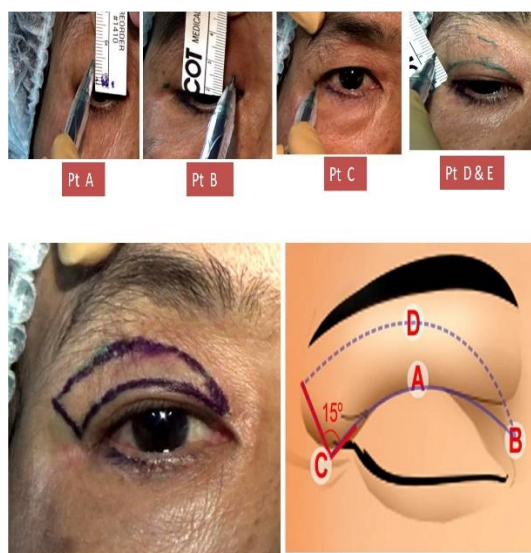
Fig. 1: Authors technique of eyelid markings for UEB

In same sitting, the ROOF is repositioned back for restoring the eyebrow volume along with its internal fixation at desired position i.e. 2-3 mm above the supraorbital rim, with two non-absorbable sutures. The orbicularis muscle is closed with interrupted 6-0 absorbable sutures. A trademark suture 'K-suture' (5-7, interrupted, horizontal mattress) is applied taking the pretarsal skin, orbicularis oculi muscle, LPS fibres and skin, to create a prominent and desired eyelid crease(Fig. 3h). The skin is then approximated with continuous or interrupted, preferably non-absorbable sutures(8-0 prolene)(Fig. 3i). One may encounter 'dog ears' at the temporal ends and the Burrow's triangle can be a good option for closing keeping the curve superiorly concave. The scar should not extend beyond the line joining lateral canthus and temporal end of eyebrow to avoid its visibility in primary gaze. Antibiotic ointment is applied with sterile dressing. The authors strongly recommend the use of small ice packs (preferably sterile) over the dressing to reduce the edema, enhance patient comfort and providing tamponade. The head end of the patient is raised and bilateral eye patching is recommended for 4-6 hours followed by patients' choice for its removal.