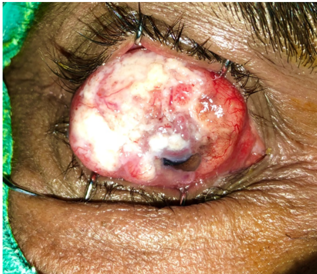
Fig. 2: Giant OSSN extending into orbit.

pose difficulty in differentiating it from conjunctival melanoma. 36