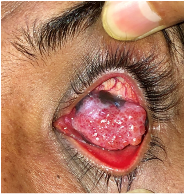
Fig. 1: Nodular OSSN generally indicating Squamous cell carcinoma.