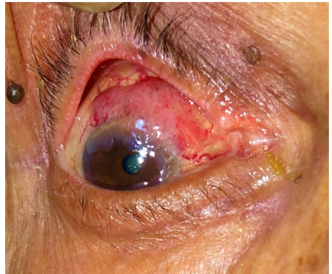
Fig. 3: OSSN is seen extending more than 180 degrees around the limbus.

Pannus, actinic disease, vitamin A deficiency, benign intraepithelial dyskeratosis, pinguecula, pyogenic granuloma, keratoacanthoma, pseudo epitheliomatous hyperplasia, malignant melanoma, and nevi, especially in patients with racial melanosis are the differential diagnosis of OSSN. 5