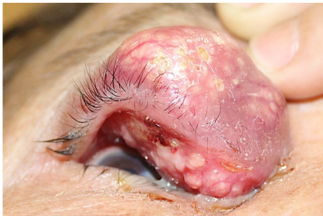
Fig. 1: Sebaceous cell carcinoma involving the entire upper lid

in the DNA mismatch repair (MMR) genes MSH2 or MLH1 and is in close linkage to a locus on chromosome 2p. 5 Expression of PD-1 and PD-L1 is also demonstrated in sebaceous cell carcinomas making it a good target for immunotherapy.